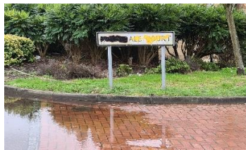
Example of criminal damage