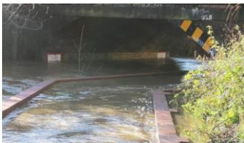
Flooding - a perennial problem