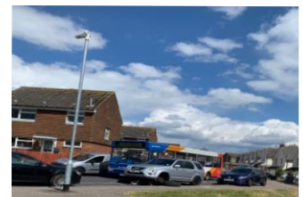
Daily Parking/traffic problems